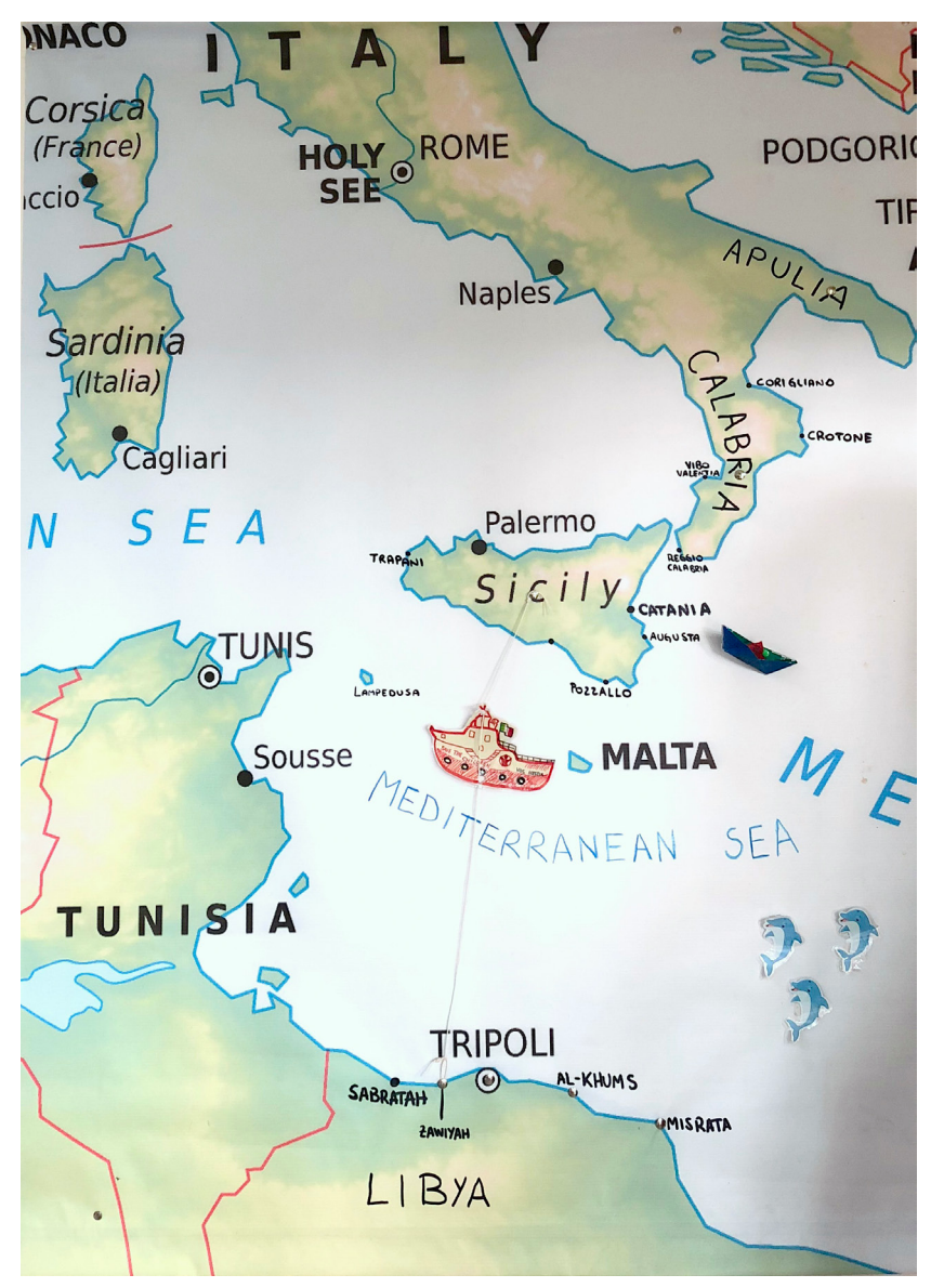
Map at the CivicoZero Center for refugee and migrant youth in Catania.