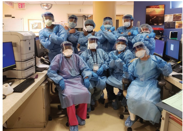
Nurses at Queens Hospital showing solidarity with NYSNA members around the state.

being issued respirators, and those who are getting them are told to reuse them.