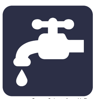
Revenue Estimate: Assembly Floor Analysis (5/22/2019).

AB 217 (Eduardo Carcia) proposed a "safe and affordable drinking water fee" in the amount of 50 cents per service connection on all retail water systems, as well as a "fertilizer safe drinking water fee" of $0.01 per $1 of all sales of fertilizing materials and $0.006 per $1 of packaged fertilizers intended for noncommercial use, a "dairy safe drinking water fee" of $0.020325 per hundredweight of milk, and a "fee" of $1,000 for the first nondairy confined animal facility (and $750 for each facility thereafter owned by the same producer, up to $12,000 per producer per year), to fund drinking water programs. The bill's tax provisions were amended out on June 13, 2019.