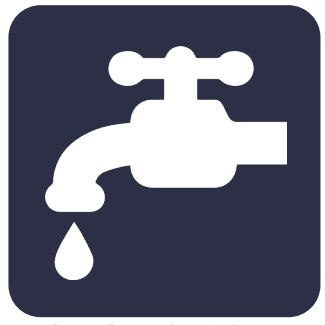
Revenue Estimate: Assembly Appropriations Committee Analysis.

AB 402 (Quirk) proposes authorizing the State Water Resources Control Board to establish and collect fees from small public water systems in specified counties that choose to have the board administer and enforce drinking water standards.