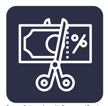
Revenue Estimate: Assembly Revenue and Taxation Committee Analysis.

AB 1606 (Cray) proposes disallowing a personal income tax deduction relating to wagering losses until a balance of $500 million is achieved and maintained in the San Joaquin Valley Regional Campus Medical Education Endowment Fund. The bill proposes requiring the state controller to determine the revenue gained from the disallowed deduction and transfer that amount from the general fund to the medical education fund.