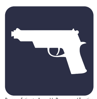
Revenue Estimate: Assembly Revenue and Taxation Committee Analysis.

AB 18 (Levine) proposes a $25 excise tax on sales of handguns and semiautomatic rifles to raise revenue to fund the California Violence Intervention and Prevention Crant Program.