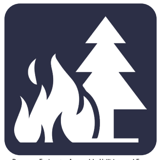
Revenue Estimate: Assembly Utilities and Energy Committee Analysis

AB 1054 (Holden) extends an expiring Department of Water Resources ratepayer charge to partially fund a wildfire insurance fund that compensates victims of wildfires. The existing charge is roughly $0.005 per kilowatt hour for most customers who are a part of the state's three large investor-owned electrical utilities. The bill was signed into law by Governor Cavin Newsom (Chapter 79, Statutes of 2019).