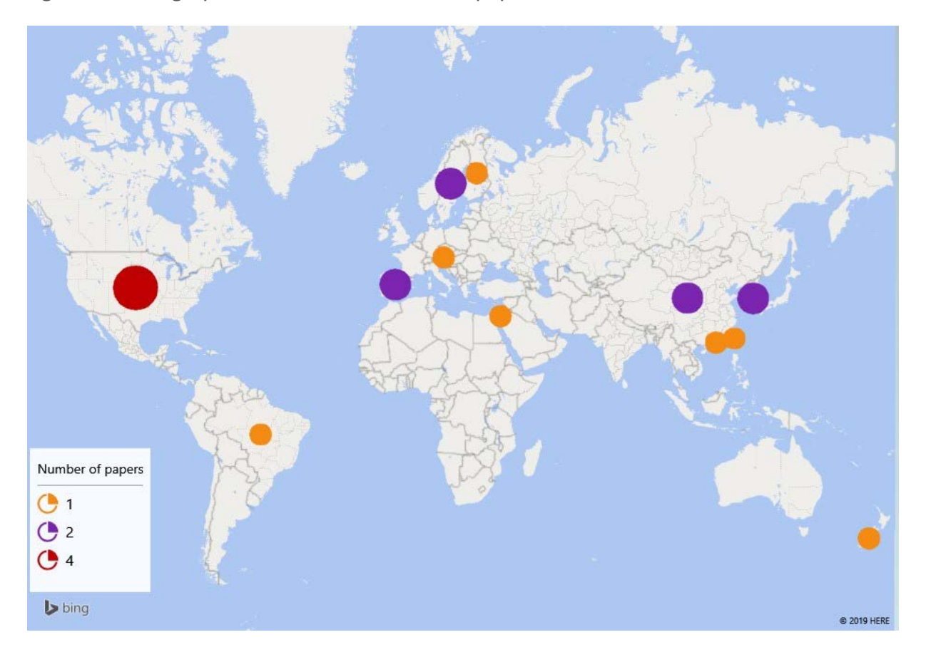
Figure 2: Geographic location of the selected papers

Note: The map shows those countries from which the papers have been selected where a country is apparent, three papers did not mention the country in which any work was carried out and so they are not presented on the map