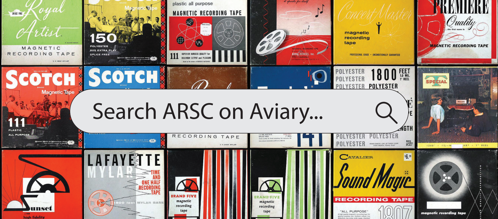
Jazz Loft Tape Boxes - Photo by Matthew Thompson

AVP is proud to support ARSC by hosting past and future conference presentations on Aviary, our publishing platform for audio and video.