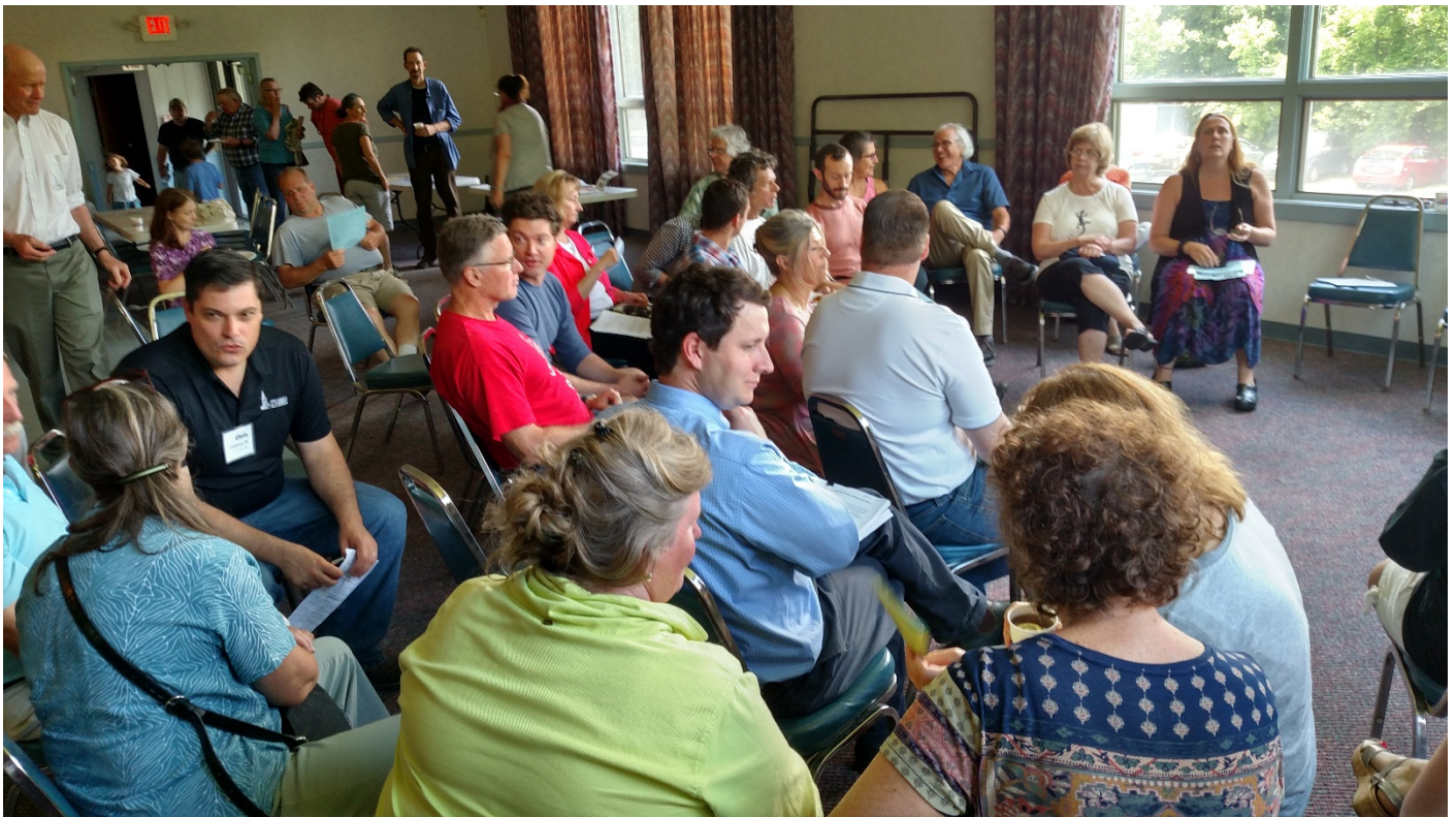
One of six focus forums on Kick-Off Day.