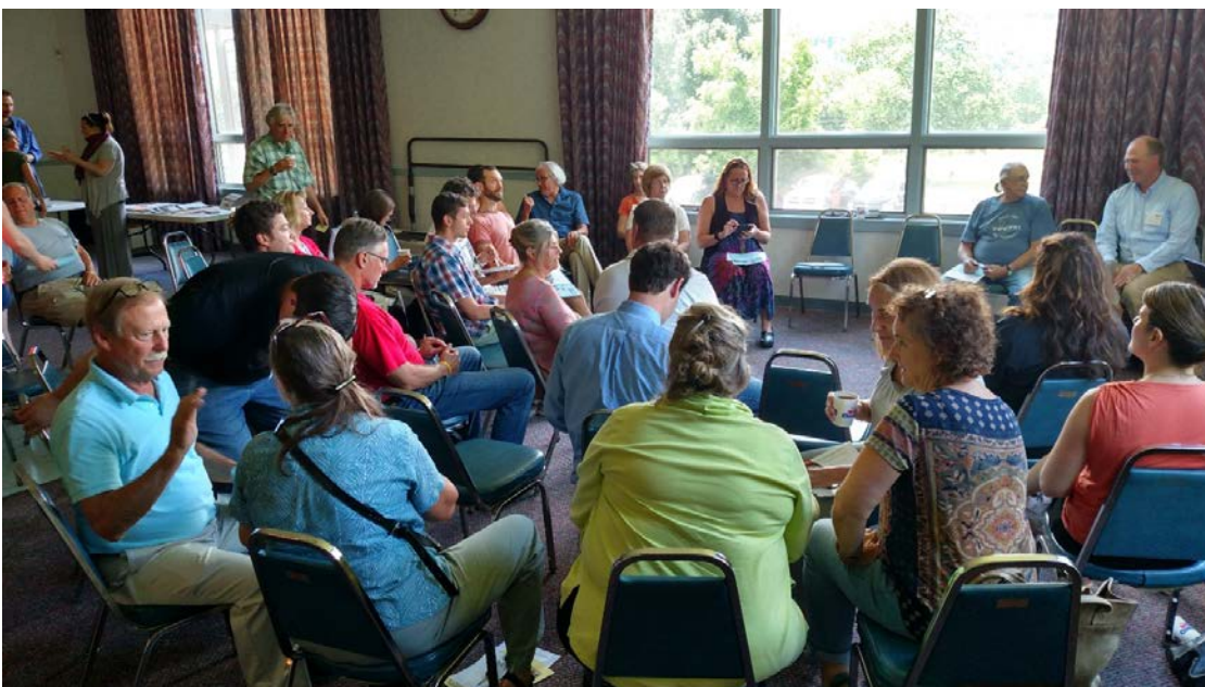
The task force met on Resource Day to begin building their work plan.

Remain engaged in the Regional Economic Development Groups and the Comprehensive Economic Development Strategy (CEDS) process ( http://accd.vermont.gov/economic-development/major-initiatives/ceds ) as it could lead to US Economic Development Authority (EDA) funded economic development projects down the line.