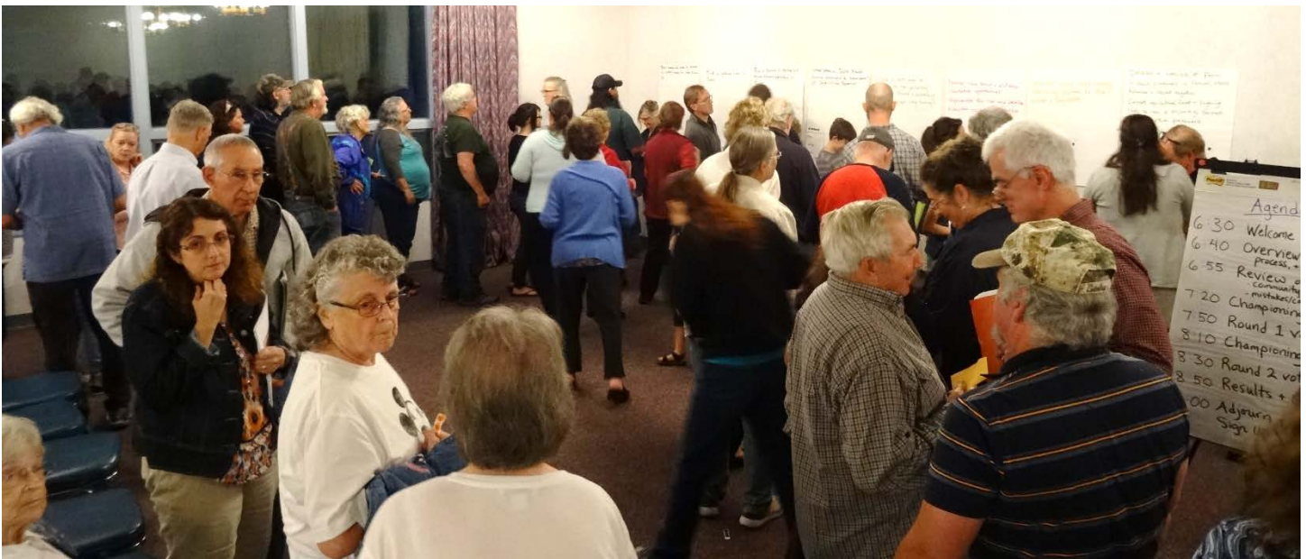
Community members took part in a dot-voting exercise to choose their top priorities for action.

Pownal has beautiful scenery that can be viewed from many of the roadways in town. Unfortunately, too many roadsides and some natural areas are marred with litter and illegal dumping. A Task Force could form to develop a community-wide green up process to pick up litter and to address illegal dumping. The Task Force could also explore having businesses or other organizations in town sponsor or "adopt" certain areas for clean-up.