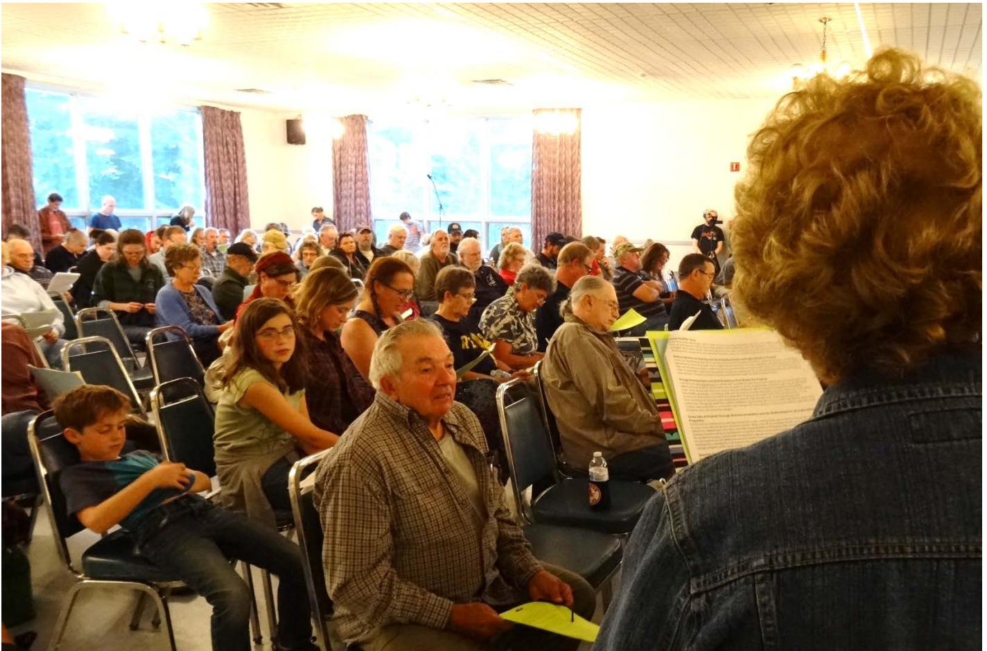
Community members read the opportunities list together at the July 25 th meeting, and then discussed and championed the ideas before taking part in a dot-voting exercise to choose their top priorities for action.

Pownal has a long history of playing host to artists and remains a home and destination for many who are part of the creative economy. The scenic beauty of the Hoosic River Valley along with proximity to other arts communities and MASS MoCA are major assets to build upon. A committee could convene to facilitate networking among existing artists, the development of shared resources like studio space, the promotion of outdoor locations for photos and painting, and the marketing of Pownal as a great community for the arts.